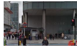
Aldgate Tower, London E1